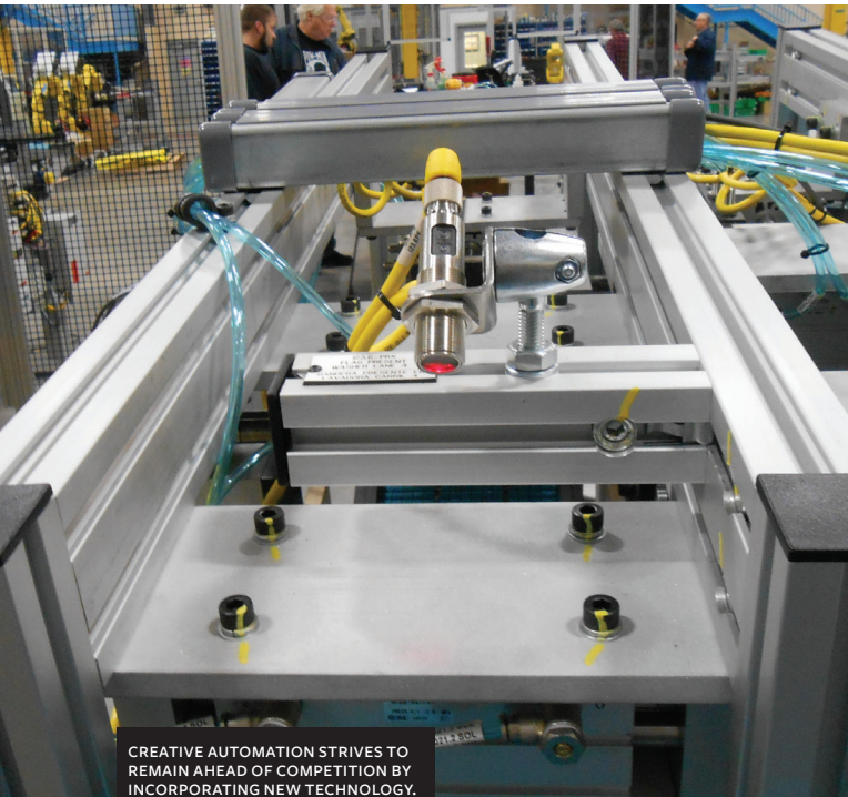
CREATIVE AUTOMATION STRIVES TO REMAIN AHEAD OF COMPETITION BY INCORPORATING NEW TECHNOLOGY.

grator of those products. For example, the company has partnered with robot manufacturers including FANUC, ABB and Denso. Working with partners such as Germany's Ro-ber GmbH, Creative Automation has added palletizing to the list of solutions it can offer customers. The company also has partnered with EFTEC Engineering GmbH to integrate robotic dispensing into its systems, and technology from WMS-Engineering GmbH and Mannesman-Demag gives Creative Automation deburring system capabilities to remove burrs from precision-machined parts. It also provides advanced cleaning technologies from its partner, trt oil-off GmbH.